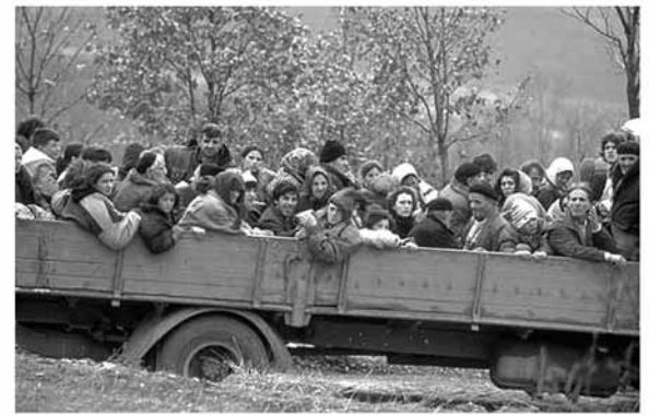
Kosovar refugees fleeing their homeland in the former Yugoslav republic of Macedonia in March 1999.