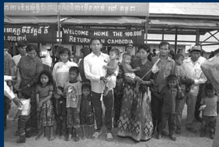
Almost 2 million people lost their lives under Pol Pot's brutal Khmer Rouge regime during the Cambodian genocide, from 1975-1979. At the Phnom Penh Reception Centre, the 100,000th Cambodian "returnee" is welcomed back home on August 28, 1992.

Over the long term, R2P will be most effective if governments develop the capacity to integrate plans to undertake preventive and other measures to protect vulnerable populations into their programmes of action on security and human rights. Civil society can work to ensure that governments are aware of and are developing strategies for fulfilling these responsibilities with an emphasis on prevention and mechanisms for early non-military action.