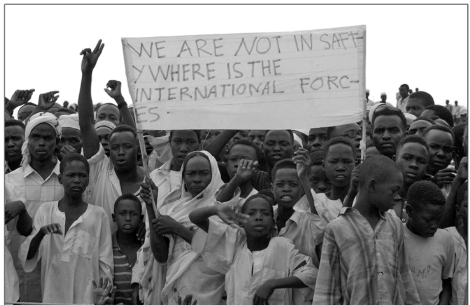
In Southern Darfur, tens of thousands of people lined both sides of the road leading to the Kalma camp to greet UN Secretary-General Kofi Annan.