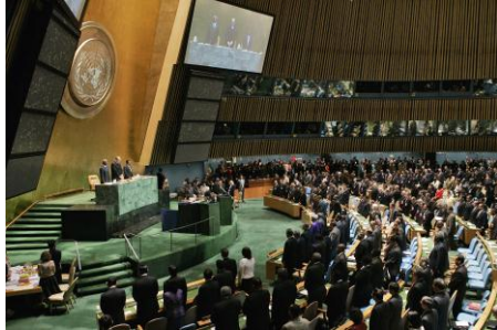
2005 World Summit opens.