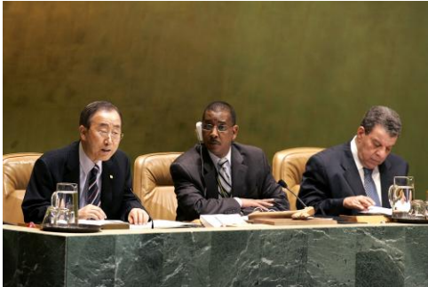
Secretary-General introduces report to the General Assembly.

Secretary-General Ban Ki-moon released on 12 January 2009 the first comprehensive UN document on RtoP. The report clarifies how to understand RtoP and outlines measures and actors involved in rendering the norm operational. It translates paragraph 138-139 of the World Summit into a 'three-pillar approach', namely 1) the protection responsibilities of the state, 2) international assistance and capacity building, and 3) timely and decisive response to prevent and halt genocide, ethnic cleansing, war crimes and crimes against humanity. The Secretary-General recommended that the General Assembly meet to consider, based on this report, how Member States will take the 2005 World Summit commitment forward.