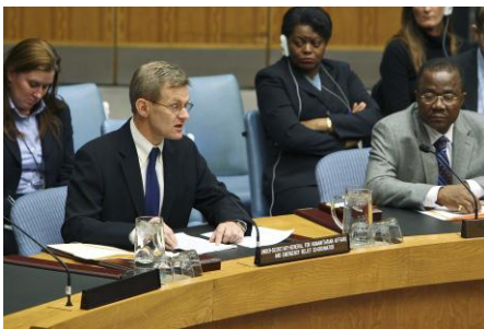
Security Council debate on the Protection of Civilians.

On April 28, 2006, the Security Council unanimously adopted Resolution 1674 on the Protection of Civilians in Armed Conflict. Resolution 1674 contains the historic first official Security Council reference to the responsibility to protect: it reaffirms the provisions of paragraphs 138 and 139 of the World Summit Outcome Document regarding the Responsibility to Protect. It also notes the Council's readiness to address gross violations of human rights, as genocide and mass crimes against humanity may constitute threats to international peace and security.