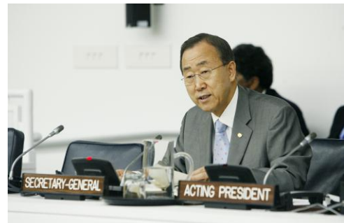
Secretary General addresses Assembly dialogue on RtoP.

The General Assembly held its second meeting focusing on the Responsibility to Protect on August 9, 2010. The informal interactive dialogue saw the participation of 42 Member States, 2 representatives from regional organizations, and 2 representatives from civil society. Constructive questions and concerns were raised on how the UN system can best gather and analyze information, develop policy options and translate them into early engagement. The majority of States reaffirmed their support for the emerging RtoP norm and welcomed the Secretary General's report on Early Warning, Assessment and the Responsibility to Protect. In addition Member States called for the continued discussion on the RtoP in the General Assembly.