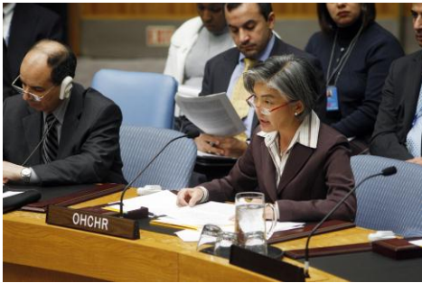
Security Council debates protection of civilians in armed conflict.

On 11 November 2009, the Security Council at its eighth open debate on the Protection of Civilians (POC) reaffirmed its commitment to prevent the victimization of civilians in armed conflict and ending ongoing violence against civilians around the world in Resolution 1894 . This resolution is the second resolution passed by the Security Council under this agenda and it recognizes that States have the primary responsibility to protect their population and reaffirms the provisions in paragraph 138-139