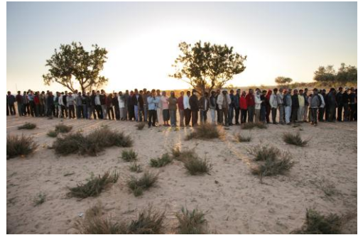
Refugees from Libya Queue for Food at Tunisia Transit Camp

This was a follow-up to Resolution 1970 , which first called upon Libya's "responsibility to protect" by referring the situation to the ICC and imposing initial financial sanctions as well as an arms embargo. Language from Resolution 1973 called the enforcement of a no-fly zone and for "all necessary measures to protect civilians and civilian populated areas under threat or attack... while excluding a foreign occupation force of any form." The Resolution condemned the Libyan government for failing to comply with international law and for allowing gross violations of human rights and attacks that may amount to crimes against humanity.