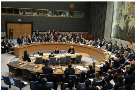
Security Council meeting on Myanmar.

On 12 January 2007, the UN Security Council met to discuss the situation in Burma/Myanmar. The members of the Council voted on a draft resolution presented by the United Kingdom and the United States. The peaceful resolution called for a cession of all attacks against minorities, access to humanitarian organizations, cooperation with the International Labor Organization, political dialogue and progress towards democracy, the release of all political prisoners and support for all UN "good offices" in Burma/Myanmar. China, Russia vetoed the resolution and South Africa voted against, arguing that Burma/Myanmar did not pose a threat to peace and security in the region, and that the internal affairs of the state did not have a place within the Security Council. Instead, they suggested that situation in Burma/Myanmar should be taken up by the Human Rights Council.