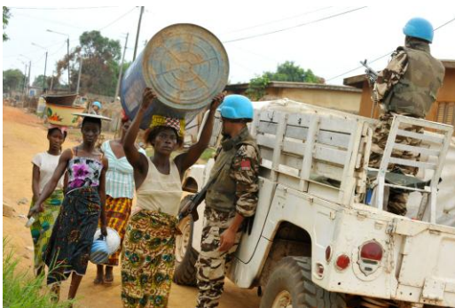
Peacekeepers Patrol Ivorian Town Hit by Post-Electoral Fighting

In response to the escalating, post-election violence against the population of Côte d'Ivoire, the UN Security Council unanimously adopted Resolution 1975 on 30 March 2011. The Resolution condemned the gross human rights violations committed by supporters of both Gbagbo and President Ouattara stating, "the attacks currently taking place in Côte d'Ivoire against the civilian population could amount to crimes against humanity." The resolution cited "the primary responsibility of each State to protect civilians," called for the immediate transfer of power to Ouattara, and reaffirmed the