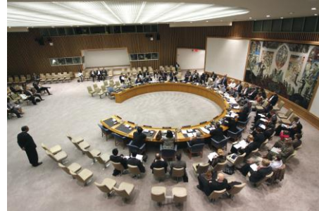
Security Council discusses the situation in the Democratic Republic of Congo.

Since the World Summit in 2005, there have been several key developments with the Responsibility to Protect (RtoP or R2P) at the United Nations. While there remains a need for all actors to continue to discuss how to implement certain aspects of RtoP, we are witnessing a clear transformation of RtoP from an idea into a norm supported by States worldwide.