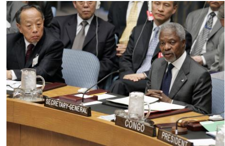
Annan addresses the Security Council on the Darfur crisis.

Because the government of Sudan has flagrantly disregarded its responsibility to protect the people of Darfur, the alarm bells have been ringing for years for the international community to take on the responsibility to protect Darfuri citizens from genocide and mass violations of human rights. On 31 August 2006, UN Security Council passed Resolution 1706 authorizing the deployment of 17,300 UN peacekeeping troops to Darfur. Although the mandate met resistance by Khartoum which prevented its deployment, the resolution referred to paragraph 138 and 139 on the Responsibility to Protect in the Summit Outcome Document and Resolution 1674.