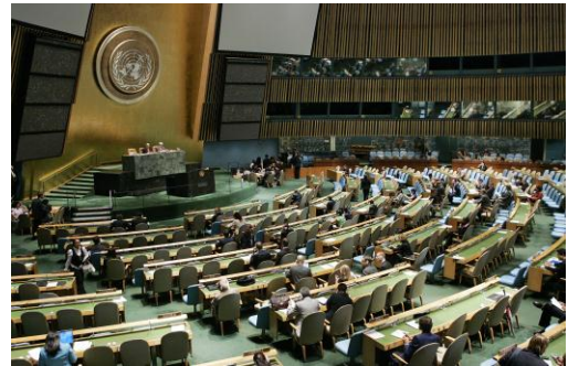
General Assembly begins debate on RtoP.

The General Assembly Debate on RtoP started on 23 July 2009 and continued the full two days of 24 July and 28 July 2009. The 92 Member States (and 2 observers) which spoke on RtoP demonstrated strong interest in the norm and made an important show of support for implementing the 2005 commitment to prevent and halt genocide, war crimes, crimes against humanity and ethnic cleansing. Governments demonstrated that they were conscientiously considering the proposals in the Secretary-General's report and also raised important issues and recommendations for the General Assembly, the Security Council, the UN departments, regional bodies and governments. Many recognized the important role of civil society in preventing and reacting to these most serious international violations.